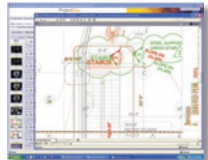
Never lose sight of critical change again ProjectDox offers advanced document comparison tools such as Overlay, allowing users to see changes instantly!

ProjectDox workflow creation tools let you customize community processes to fit the way you work and collaborate. Visualize your processes by dragging and connecting workflow objects together (via Microsoft Visio), then quickly create the proper electronic forms using Microsoft Word.